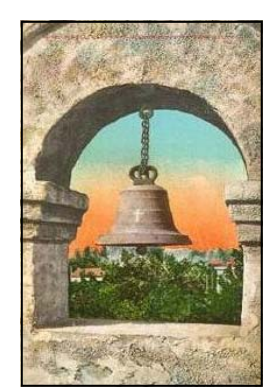
Mission Inn Bell