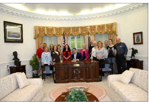
In the Oval Office with President Obama

Next, the group was shown models of the Senate, the House of Representatives, the Supreme Court, and with each came valuable information on the structure of government. Tour members were then given a test of physical agility - they had to put on booties over their shoes while standing in the hallway. The reason for the booties was apparent as the group stepped into the reproduction of the Oval Office. A light, tan carpet with the Presidential seal covered the floor, and it was apparent that it would not take the constant shoe traffic of tourists. The office is an exact reproduction from the time of Pres. Ronald Reagan. Many of the artifacts remained as new presidents took his place. The centerpiece of the office is a large desk called "The Resolute." It has been used by twenty-two presidents since 1880 when it was presented to Pres. Hayes by Queen Victoria. The Resolute was the name of a British ship that had been encased in ice in the Arctic, and its crew abandoned her. The desk was from this ship, and had been altered with front panels to hide Pres. Franklin D. Roosevelt's infirmity. The particular desk in the Quality West Wing display actually was a reproduction that