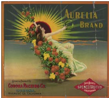
Corona Packing Co. Label

P.O. Box 2904 Corona, California 92878-2904