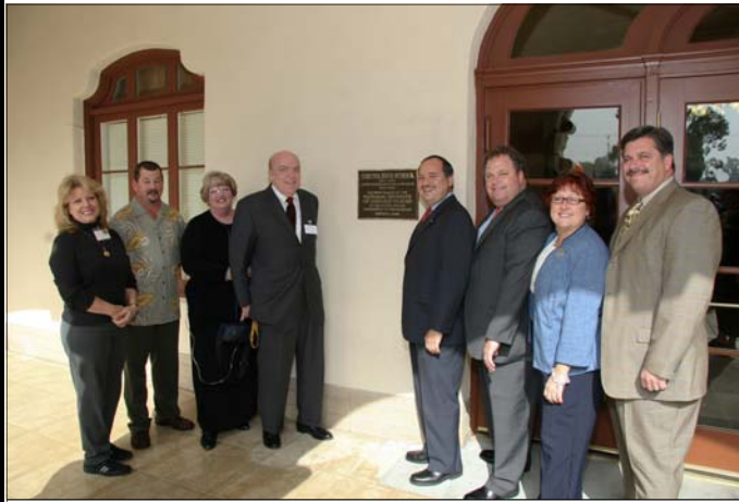
CHPS Board members join Mayor Montanez & City Councilmembers after unveiling of bronze plaque