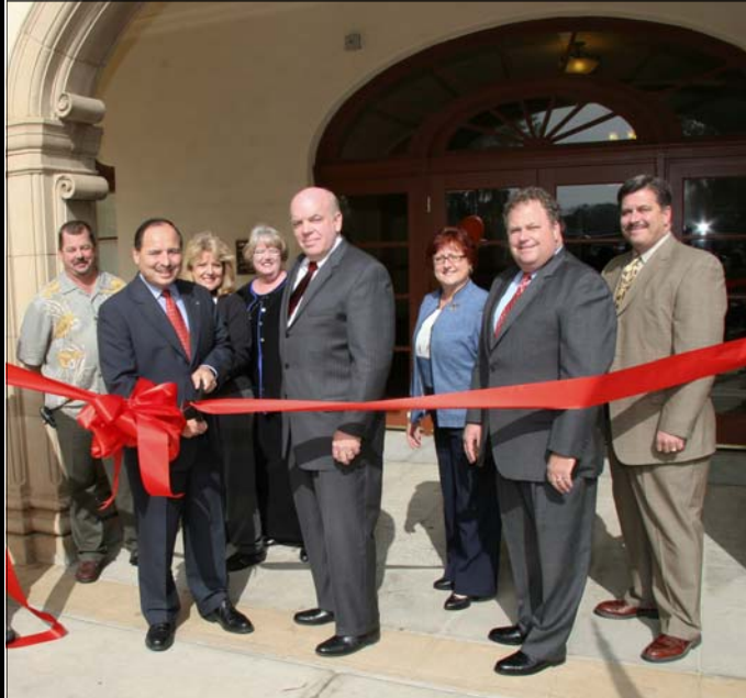
After the red ribbon was cut, all were invited to tour the Historic Civic Center & view the results of hard work by all involved to preserve and protect this architectural treasure

On Tuesday, November 6, 2007, a public get-together convened in front of the classic arcade arches in front of Corona's second High School, now known as the Historic Civic Center. The event served to celebrate the completion of the building's renovations, to dedicate the bronze marker identifying the structure as having been placed on the National Register of Historic Places, and to recognize the building's new tenants.