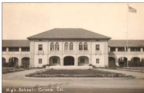
Corona High School postcard c. 1920s

The city's purpose in initiating these renovation/restoration efforts was to preserve the architectural integrity of this remarkable landmark and to have it continue to be a facility that the community can utilize and enjoy for many years to come.