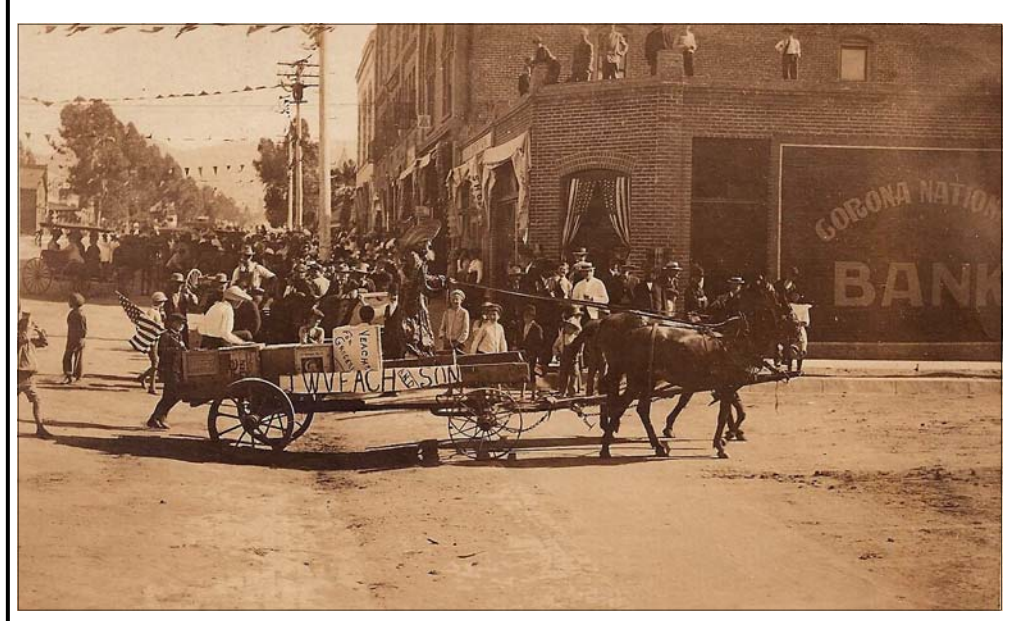
4th of July Parade in Corona circa a century ago

Complete with American flags, bunting and banners, this vintage postcard shows how Coronans celebrated July 4th some 100 years ago at the original corner of Sixth and Main Streets. Grocers' J. W. Veach and Son wagon is westward bound on Sixth Street with Corona National Bank in the background. Note the group of parade viewers atop the building wanting to get a bird's eye view of the patriotic procession. As was customary of that era, Coronans are gussied up for the community celebration and nearly everyone is wearing some type of headgear -fashionable millinery, caps, straw hats and even a bowler or two.