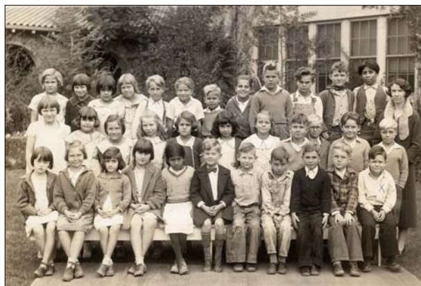
This photo of a 1930s 3rd grade class from Jefferson Elementary School was used throughout curriculum