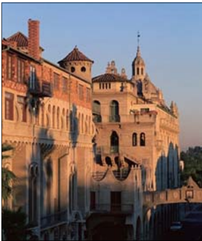
Tour of Mission Inn is July 10th

P.O. Box 2904 Corona, California 92878-2904