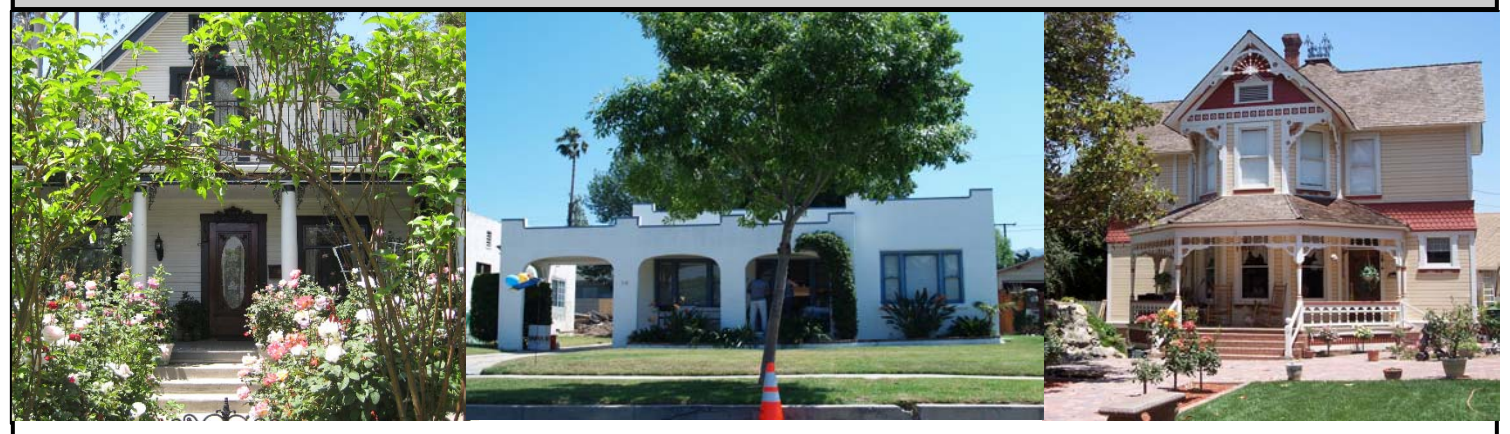
1140 Garretson Avenue