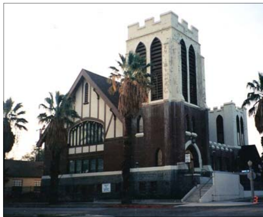
The First Congregational Church was recently named an Historic Landmark on Corona's Register of Historic Resources.

established in Corona. This gothic revival structure has beautiful stained glass windows and interior and exterior design elements that make it truly unique. The church has been a showcase element in our community for nearly 100 years. We are very happy that this historic church has been officially recognized.