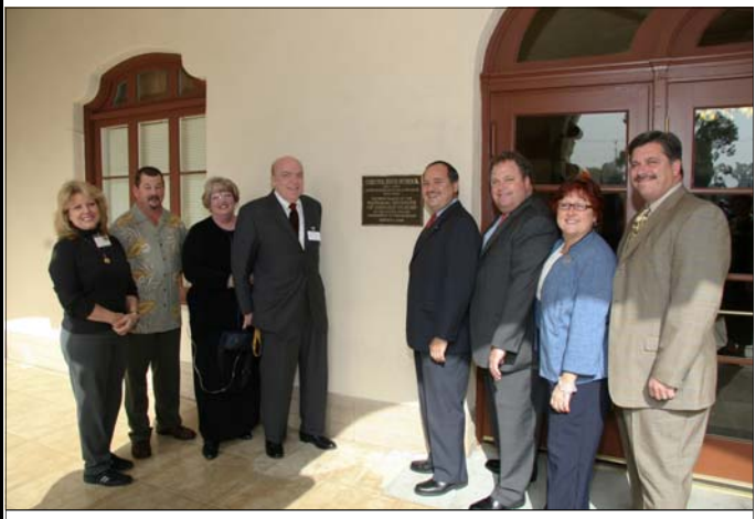
CHPS Board members join Mayor Montanez & City Councilmembers after unveiling of bronze plaque