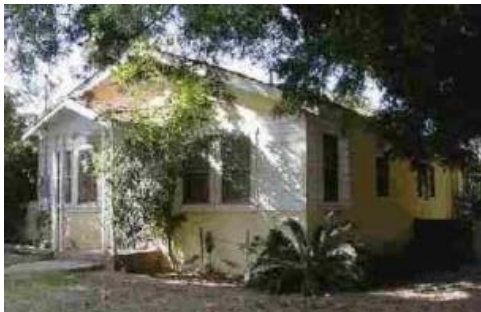
Home of Corona Model Railroad Society