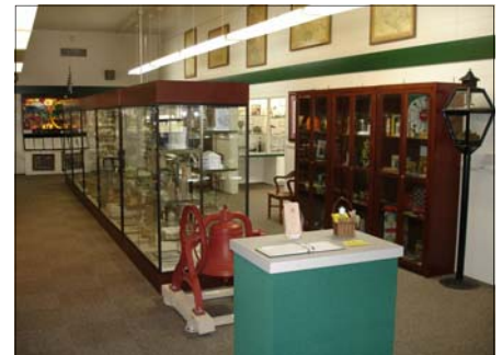
Interior of Heritage Park Museum

DON'T MISS OUT on MARCH 7: Special visit to Heritage Park Museum and Corona Model Railroad Society See page 3