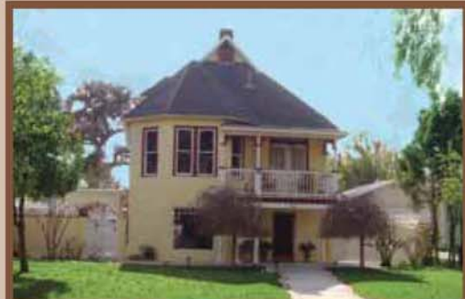
1169 East Grand