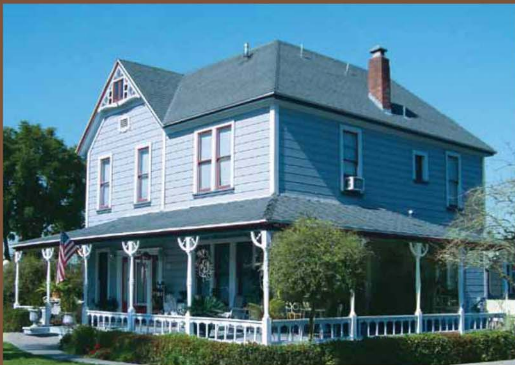
1052 East Grand

Saturday, May 1, 2010 • 1:00 P.M. – 4:00 P.M.