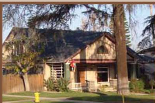
1420 South Main