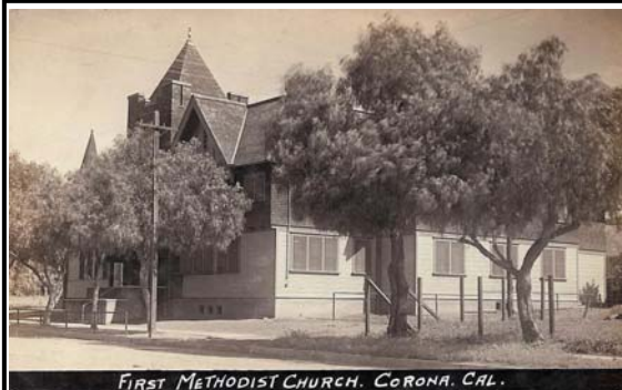
FIRST METHODIST CHURCH. CORONA, CAL.