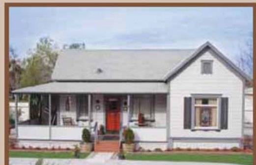
1058 East Grand

Antique Automobiles on Display at 1052 E. Grand