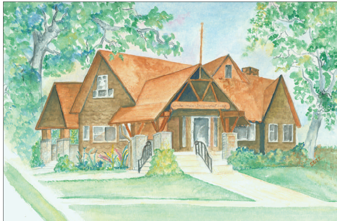
Woman's Improvement Club 1101 South Main Street

Annual Board Member Election will be held