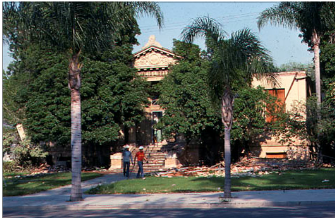
The demolition of Corona's Carnegie Library is seen here in April 1978. The site has remained an empty field ever since.

The responses that each contender provided are included in this newsletter. Please read what they had to say and thoughtfully consider the responses. Each