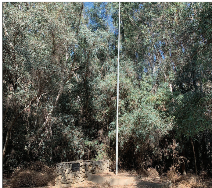
Monument and flag pole as seen in 2019, after some of the brush had been removed

members of the Corona Active 20-30 Club. They