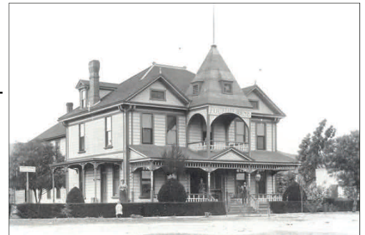
Fountain House Hotel in Murrieta