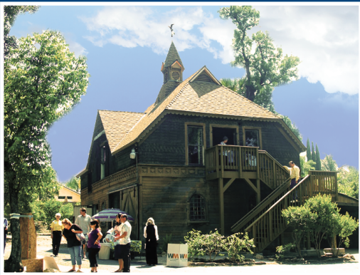
THE UPPER IMAGE OF THIS CARRIAGE HOUSE SHOWS THE LONG, STEEP STAIRWAY THAT REPLACED THE ORIGINAL. THE IMAGE BELOW FEATURES THE STAIRWAY RESTORED TO ITS ORIGINAL ROUTING AND BEAUTY.

It is the Corona Historic Preservation Society's desire to preserve historic sites and buildings in Corona.